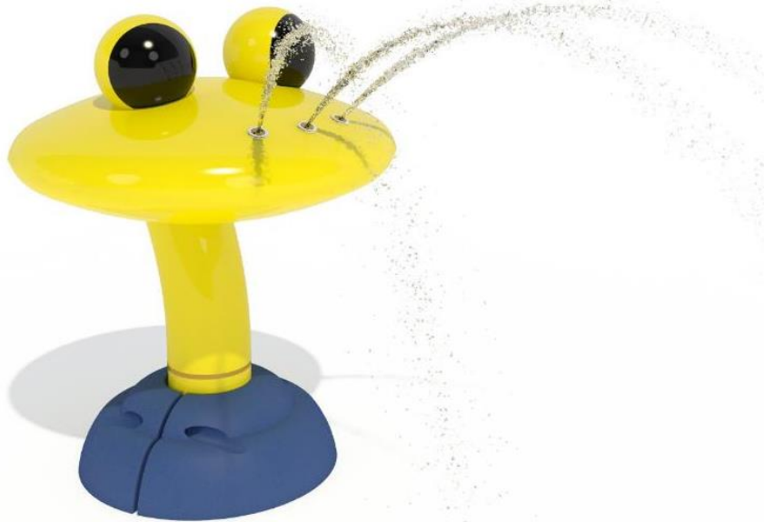
Frog Spray (360 rotation)

Potential secondary play structures in the Children's Pool.